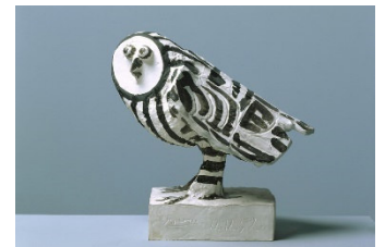
Pablo Picasso (1881–1973) The Owl , 1952, 12.12. Fired clay, painted, 34 x 25 x 34.5 cm Hamburger Kunsthalle, acquired in 1956 © Succession Picasso / VG Bild- Kunst, Bonn 2026