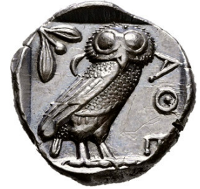
Athens, tetradrachm (440–420 BC) Reverse of the coin: owl Silver, Ø 24 mm, 17.09 g © Hamburger Kunsthalle

The exhibition areas extending across 1,500 square metres on the ground floor of the founding building (opened in 1869) and extension (opened in 1919) have been extensively modernised and equipped with display elements developed specially for SCULPTURAL . The comprehensive research project on the miniature sculptures, along with the modernisation of the premises and forms of presentation, as well as the exhibition itself, have been made possible by funding totalling 4 million euros from the Dorit & Alexander Otto Foundation . The foundation is thus once again acting as a leading sponsor for the Hamburger Kunsthalle. The foundation most recently demonstrated its extraordinary commitment to the museum in 2014–16, when its funding enabled extensive structural modernisation. The Kunsthalle drew here on the expertise of Alexander Otto's company ECE, as it has once again for the design of the new exhibition spaces.